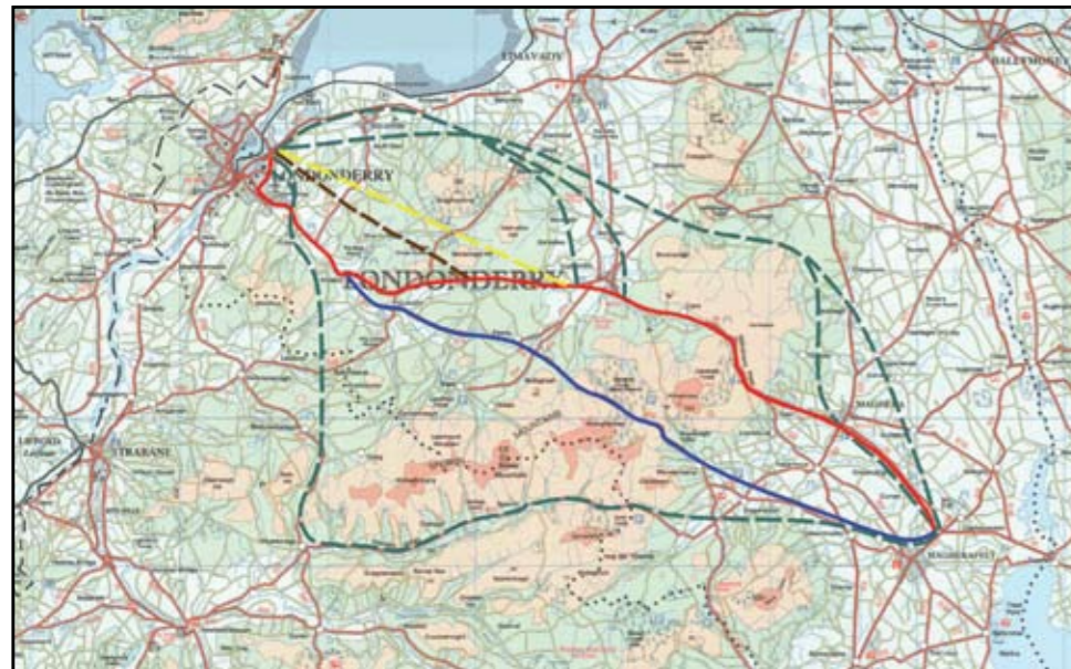
Castledawson Roundabout to Derry Corridors examined during selection of 'Preferred Corridor'